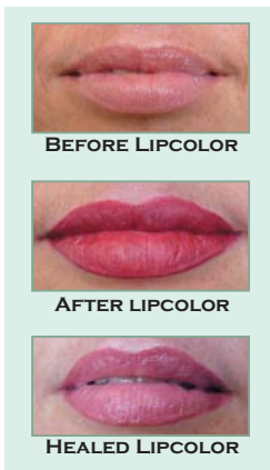
*All photos unretouched originals